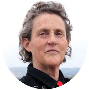
TEMPLE GRANDIN PH.D. WORLD-RENOWNED AUTISM ACTIVIST, BEST-SELLING AUTHOR, ANIMAL WELFARE AND BEHAVIOR EXPERT

Grandin is one of the most accomplished and well known adults with autism in the world. Her life, was brought to the screen with the HBO full-length film Temple Grandin, starring Claire Danes. Dr. Grandin has been inducted into the American Academy of Arts and Sciences September 2016, featured on NPR, and she has a 2010 TED Lecture titled "The World Needs ALL Kinds of Minds."